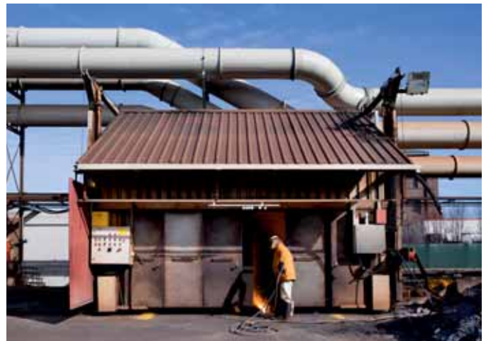
Mobile exhaust hood