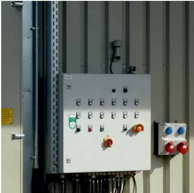
Local control point

The exit air complies with the maximum permissible clean gas dust content regulations and is released into the atmosphere through a silencer and the exit gas stack.