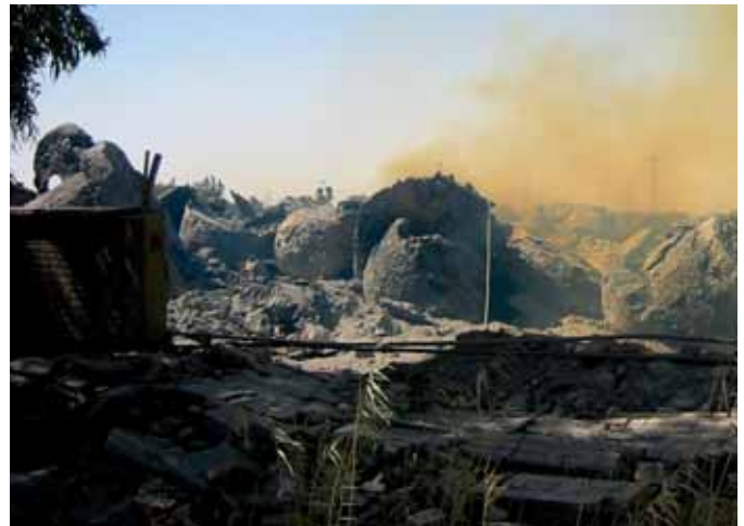
Smoke produced during slag block flame-cutting

In preparation for treatment in the blasting-pit, so-called blasting holes are flame-cut into the scrap using thermal torches. These are filled with a blasting agent and fuses. Then the material is detonated.