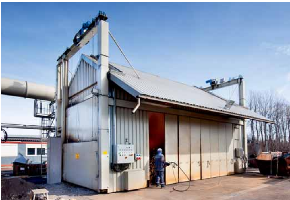
Additional exhaust hood – "new design"

the project and the result has completely fulfilled our expectations."