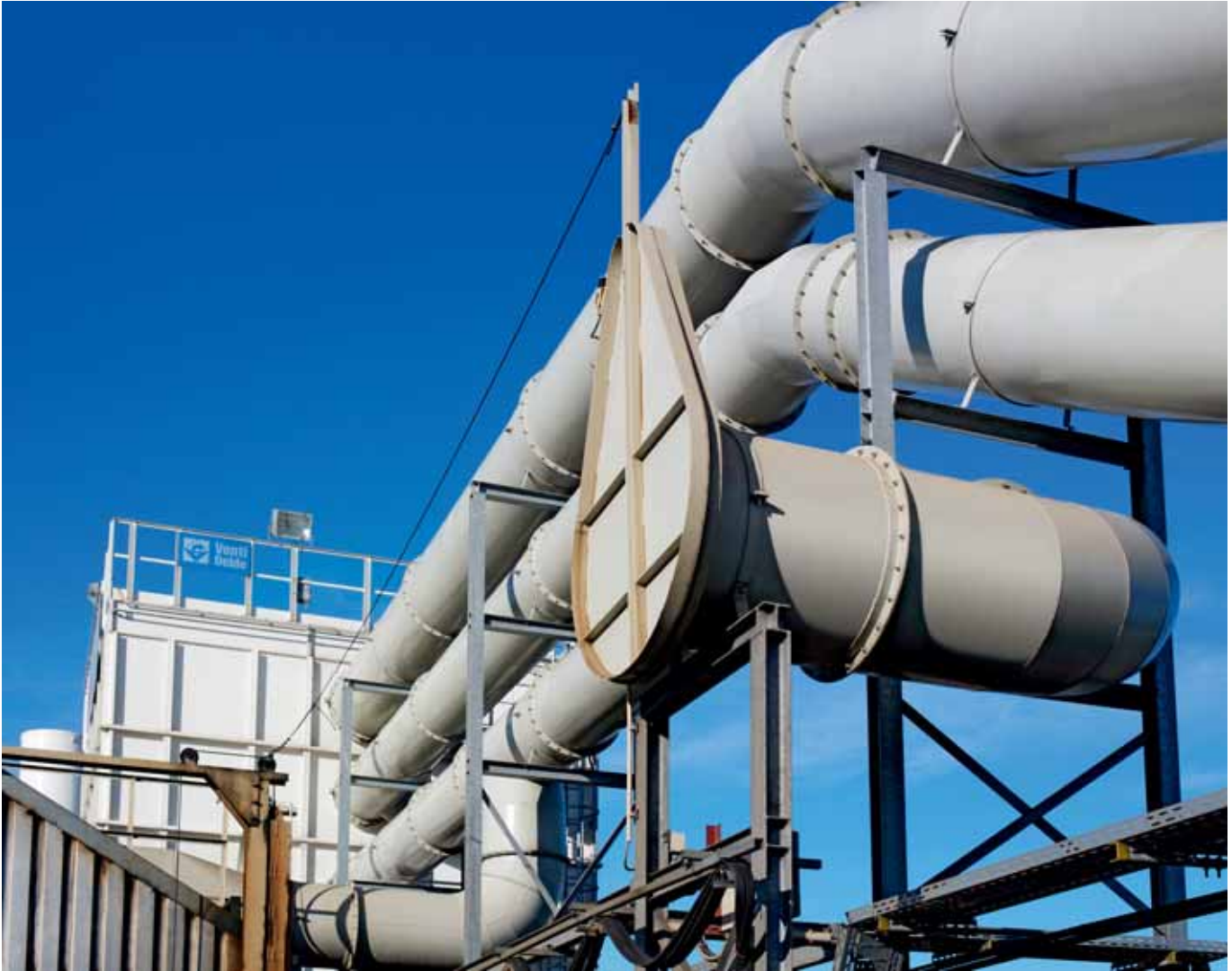
Shutoff device and duct system