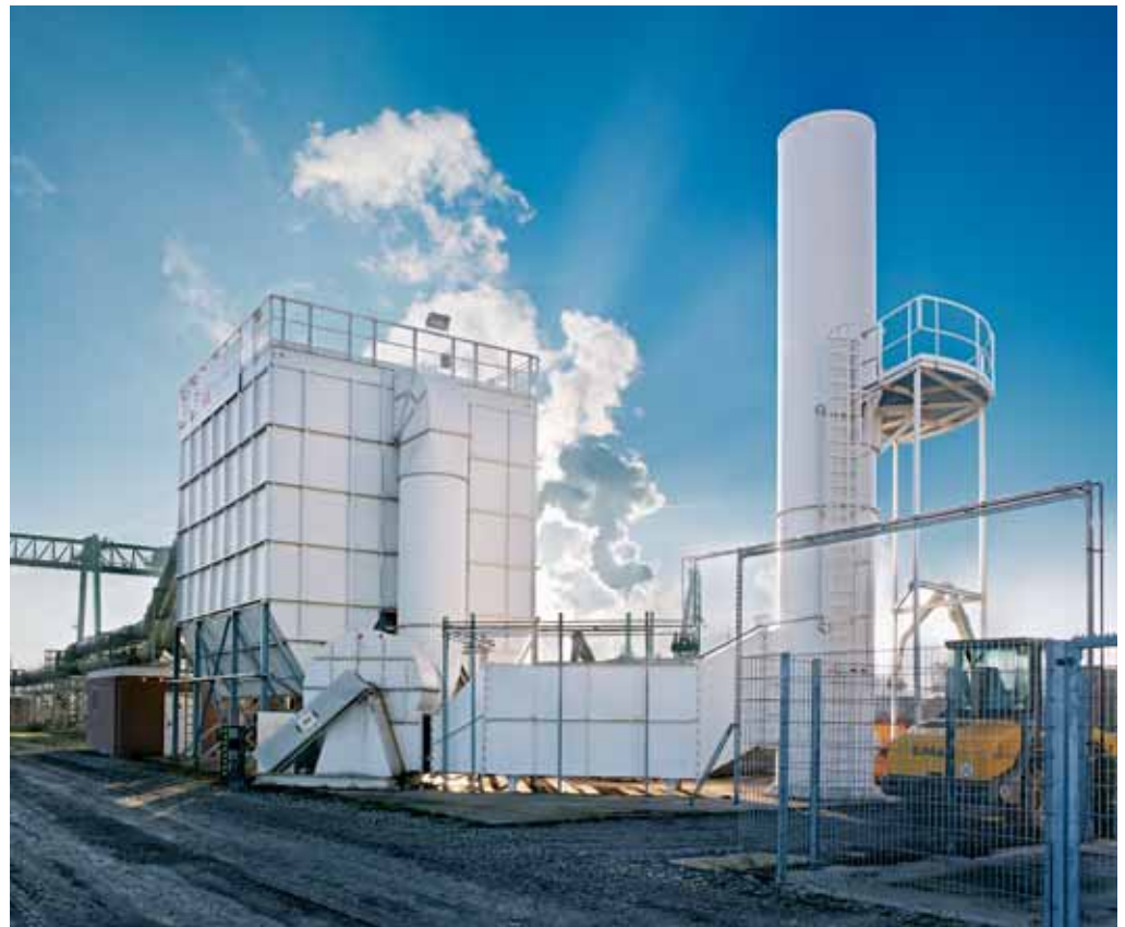
Filter plant with fan, silencer and stack