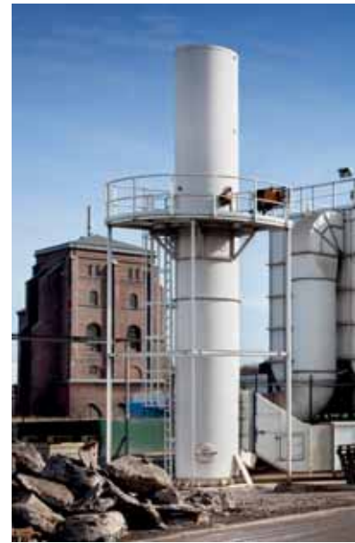
Upgrading the filter plant

completely redesigned the new hood in 2012, adapting it to the increased demands. The development is based on the many years experience which Venti Oelde as plant manufacturer has gained in the area of gas torch cutting and fulfils in every respect the demands of the operator, RRD. Willam specifically confirmed this: "Venti Oelde constructed the new hood individually and exactly in accordance with our specifications and dimensioned the additional exhaust plant precisely in compliance with our requirements. Their many years experience was from the beginning the basis of